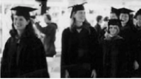
GSFA students line up to receive their degrees

In the Fiftieth Anniversary year of the department, forty-eight students received a degree in City and Regional Planning at Penn. Forty-seven students were awarded a MCP degree and one student received a PhD. One student received a certificate.